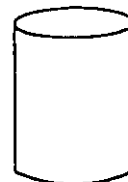
SAMPLE CUP Diameter: 14mm Height: 18 mm Matena:s: Pyrex glass