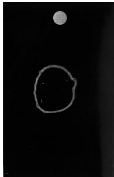
A good quality coating.