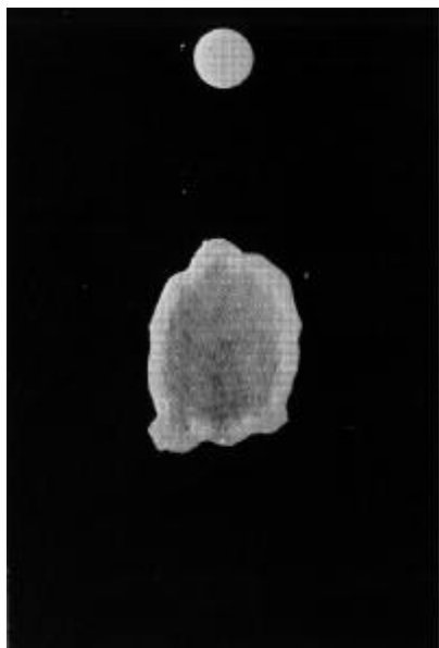
A poor quality coating.