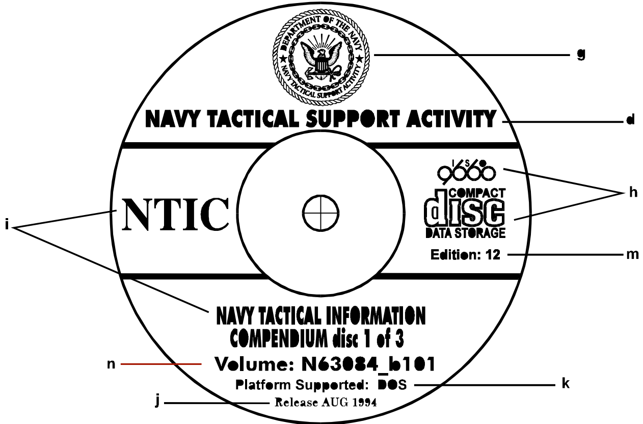
FIGURE 2. Sample UNCLASSIFIED Label

NOTES: Letters correspond to paragraphs in 4.3. This is an example only. Note the locations for the classified ring, disc classification, and handling caveats. Components/agencies may tailor the rest of the label layout.